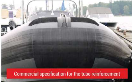
Commercial specification for the tube reinforcement