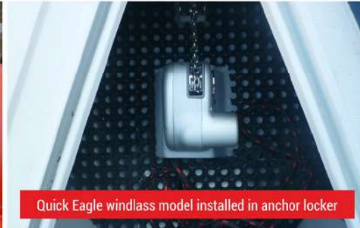
Quick Eagle windlass model installed in anchor locker