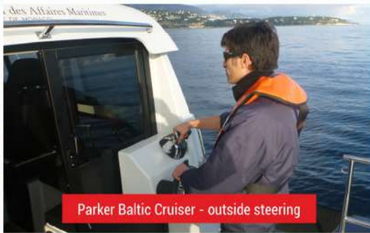
Parker Baltic Cruiser - outside steering