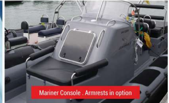
Mariner Console . Armrests in option