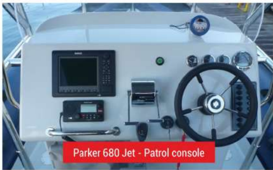
Parker 680 Jet - Patrol console