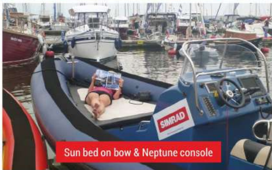
Sun bed on bow & Neptune console