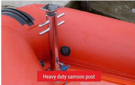
Heavy duty samson post