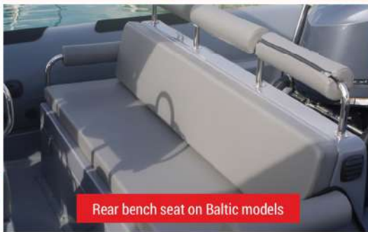
Rear bench seat on Baltic models