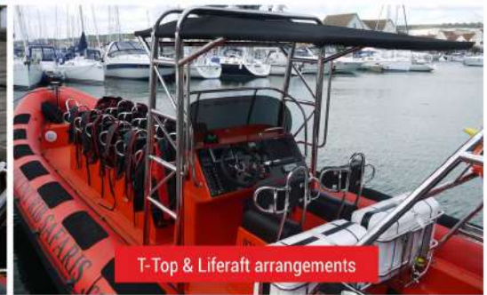
T-Top & Liferaft arrangements