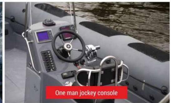
One man jockey console