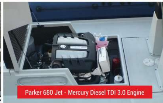
Parker 680 Jet - Mercury Diesel TDI 3.0 Engine