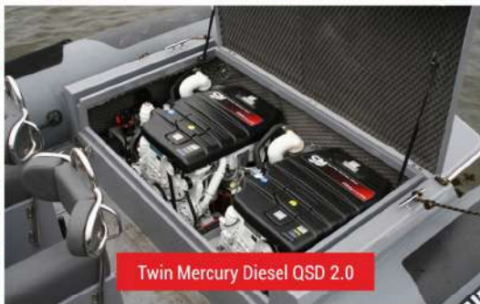
Twin Mercury Diesel QSD 2.0