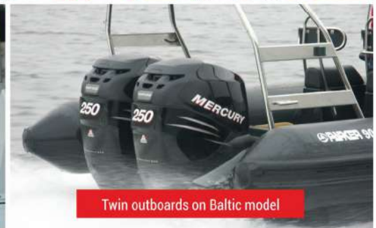
Twin outboards on Baltic model